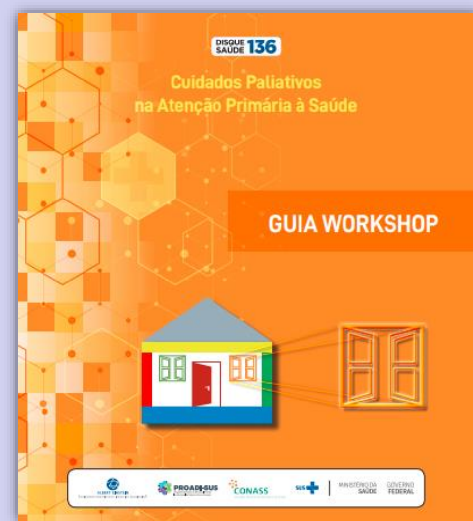
Image: Workshop Guide